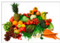
vegetables / fruits

Healthy Fats and Oils: Surprised that the Healthy Eating Pyramid puts some fats near the base, indicating they are okay to eat? Although this recommendation seems to go against conventional wisdom, it's exactly in line with the evidence and with common eating habits. The average American gets one-third or more of his or her daily calories from fats, so placing them near the foundation of the pyramid makes sense. Note, though, that it specifically mentions healthy fats and oils, not all types of fat. Good sources of healthy unsaturated fats include olive, canola, soy, corn, sunflower, peanut, and other vegetable oils, trans fat-free margarines, nuts, seeds, avocados, and fatty fish such as salmon. These healthy fats not only improve cholesterol levels (when eaten in place of highly processed carbohydrates) but can also protect the heart from sudden and potentially deadly rhythm problems.